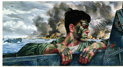
First Wave: Going In, Peleliu, 1944 , oil on canvas, 22" x 42", LIFE collection of art WWII USACMH, Ft. Belvoir, VA.