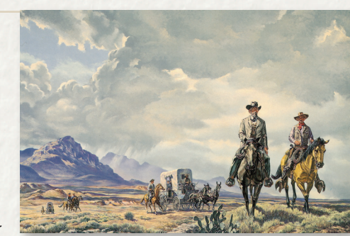
ART CREDITS SEPT. 28 IMAGE: Lea, T. (1985) View of UTEP (Casein Tempera) 15" x 20". Collection of C.L. Sonnenhisen Special Collections Department, UTEP Library. OCT. 12 IMAGE: Lea, T. (1965) The First Recorded Surgical Operation in North America: Cabeza de Vaca 1535 (chinese ink) 20" x 28". Collection of Moody Medical Library, U.T. Medical Branch, Galveston, TX. OCT. 20 IMAGE: Lea, T. (1974) The Original Press logo [ink]. Courtesy of Texas A&M Press OCT. 26 IMAGE: Lea, T. (1960) Pasaron Por Aqui [Granite lintel over Brown Street door] Collection of the International Museum of Art, El Paso, TX. NOV. 14 IMAGE: Lea, T. (1940) Stampede [oil on canvas] 5 1/2" x 16". Post Office, Odessa, TX, on loan to Ellen Noel Museum. MARCH 23 IMAGE: Lea, T. (1965) Ranger Escort West of the Pecos [oil on canvas] 36" x 52". Collection of FHRHC, U.T. Austin. APRIL 13 IMAGE: Lea, T. (1942) Comanches , mural, [oil on canvas] 5' x 13' 17". Post Office, Seymour, TX. © Catherine Lea Weeks.

TEXAS RANGER HALL OF FAME AND MUSEUM • 100 Texas Ranger Trail, Waco, TX 76706