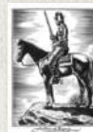
Antonio de Espejo Travelers George W. & Laura Bush, Dallas