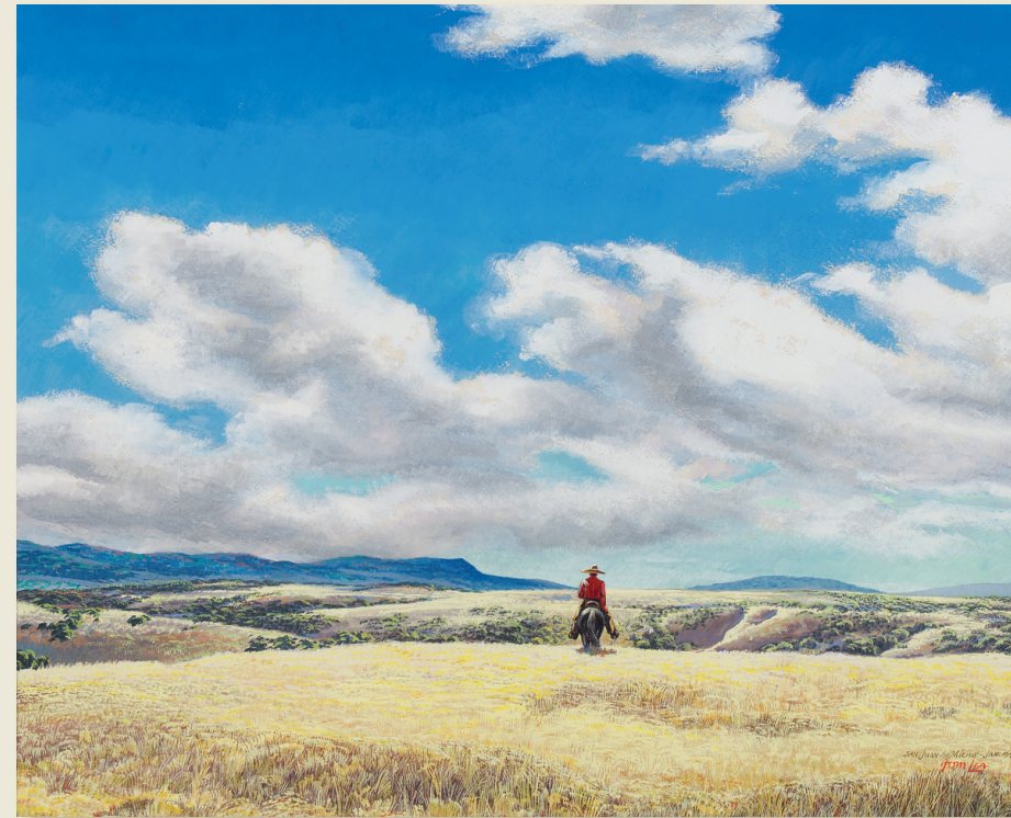
Hills of Mexico , 1946. Casein tempera, 16 x 20. Collection of Wells Fargo Bank, El Paso.