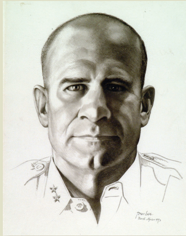
Maj. Gen. Jimmy Doolittle, 1943. Brush and Chinese ink, 19 x 14. U.S. Army Center of Military History, Fort Belvoir, Virginia.

“Jimmy” Doolittle was an American aviation pioneer who served as a commissioned officer in the United States Army Air Forces during World War II and was awarded the Medal of Honor for his valor and leadership. He led the Doolittle Raid on Tokyo on April 18, 1942, the first air raid to strike the Japanese Home Islands in retaliation for the Japanese attack on Pearl Harbor. Sixteen modified bombers and their five-man crews were launched from the USS Hornet, the same carrier Tom Lea lived on for three months in the late summer and fall of 1942. Lea recorded the lives and responsibilities of the men on board, and witnessed the torpedoing of the USS Wasp. Tom Lea met Doolittle near Tunis, where he had a villa in a little town called