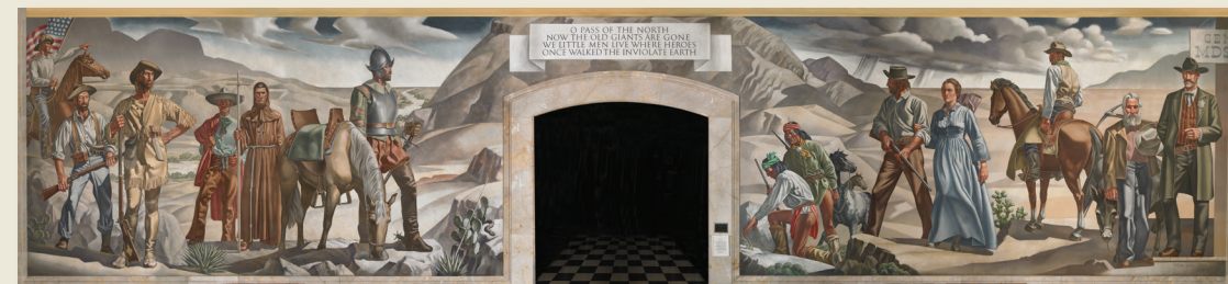
O Pass of the North, Now the Old Giants Are Gone We Little Men Live Where Heroes Once Walked the Inviolable Earth , 1938. Oil on canvas, 11 x 54 feet. U.S. Courthouse, El Paso, Texas. Commissioned through the Section of Fine Arts, 1934-1943. Fine Arts Collection, U.S. General Services Administration.