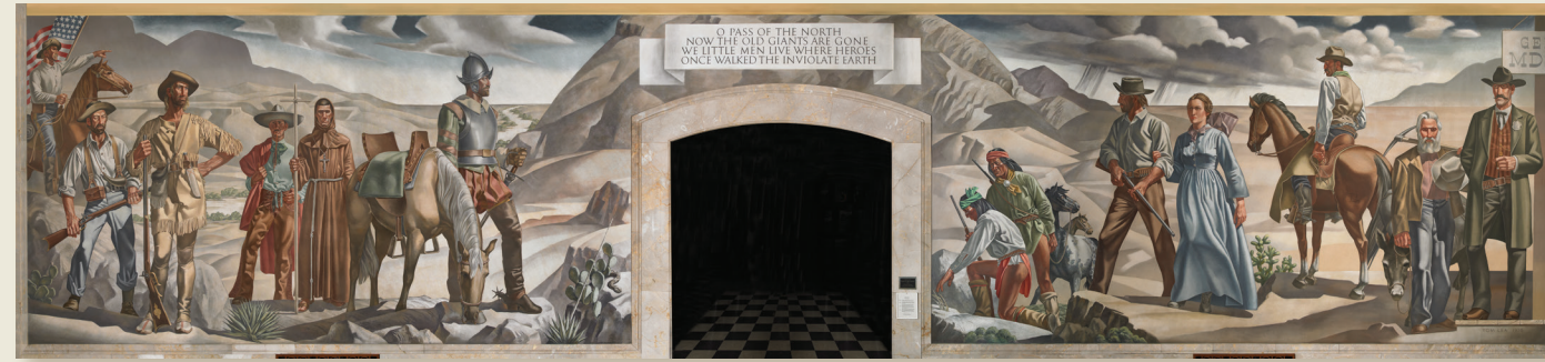
O Pass of the North, Now the Old Giants Are Gone We Little Men Live Where Heroes Once Walked the Inviolable Earth , 1938. Oil on canvas, 11 x 54 feet. U.S. Courthouse, El Paso, Texas. Commissioned through the Section of Fine Arts, 1934-1943. Fine Arts Collection, U.S. General Services Administration.